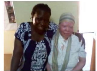
Back from Mulago ready to live on

These Photos show the rapid progress of disease up to operation. The wound has now healed and she is doing well. All tested lymphnodes showed that no spread of the disease.